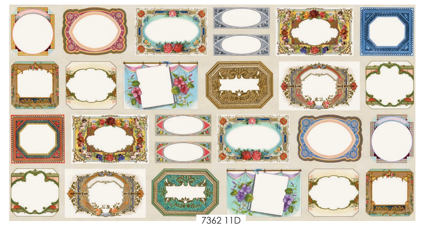
7362 11D reduced to show Full WOF. Largest label is approx 8" x 5". Smallest label is approx. 6" x 2.25"