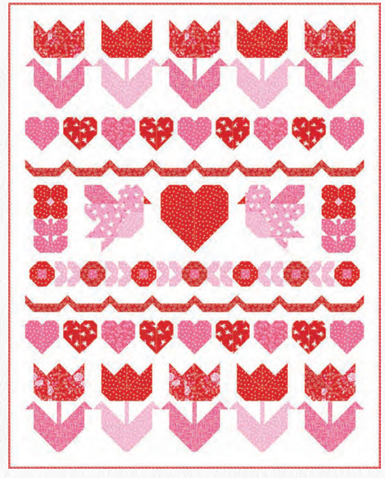
SIH 048 Sweet Sentiment 44" x 55"