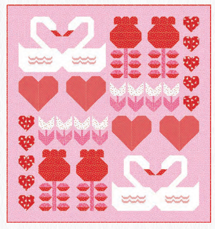
SIH 047 A Swans Love 51" x 55"