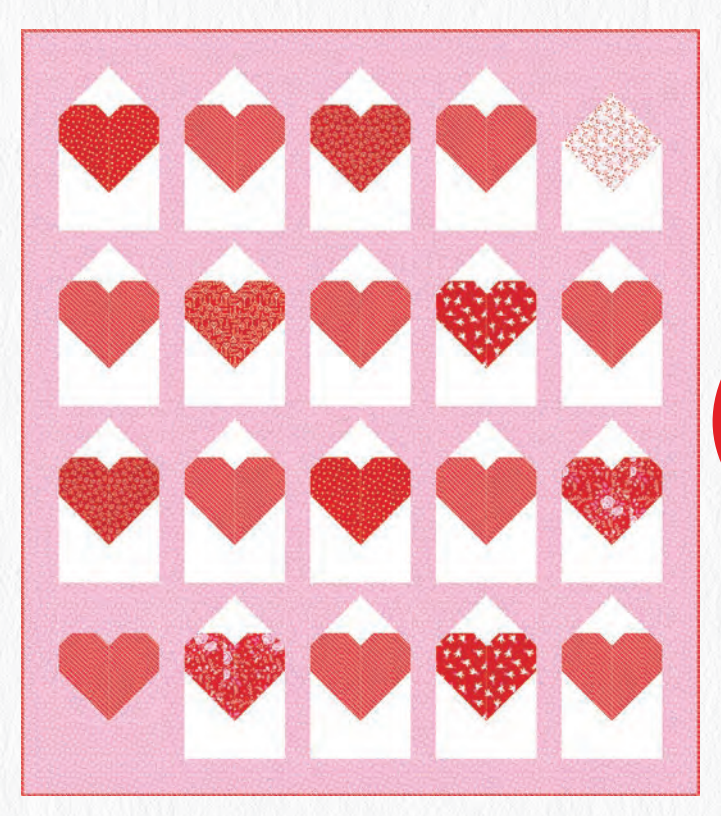
SIH 049 Be My Valentine 56" x 61"