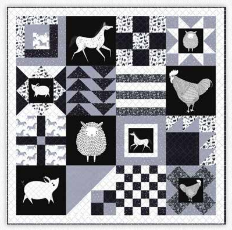
GB 035 / GB 035G LUCKY CHARM BLACK & WHITE - 52" x 52"