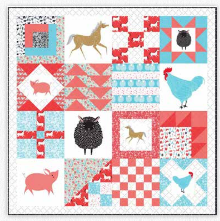
GB 035 / GB 035G LUCKY CHARM - 52" x 52"