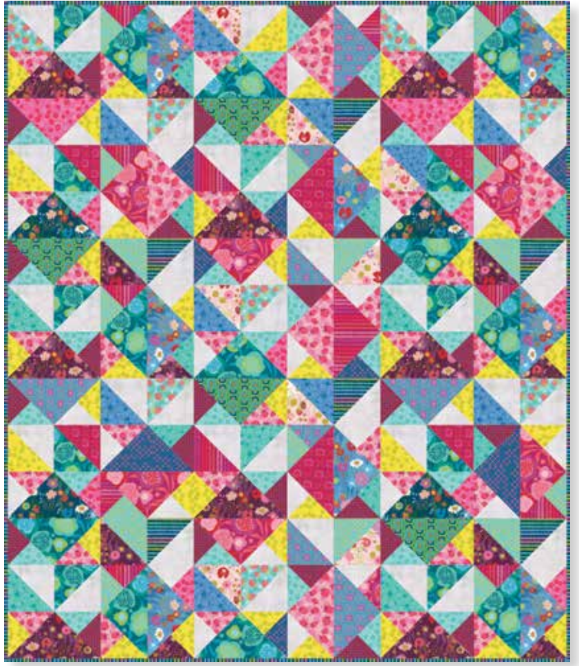
pattern by Crystal Manning CMA 865 / CMA 865G Strawberry Rhubarb Size: 72" x 84"