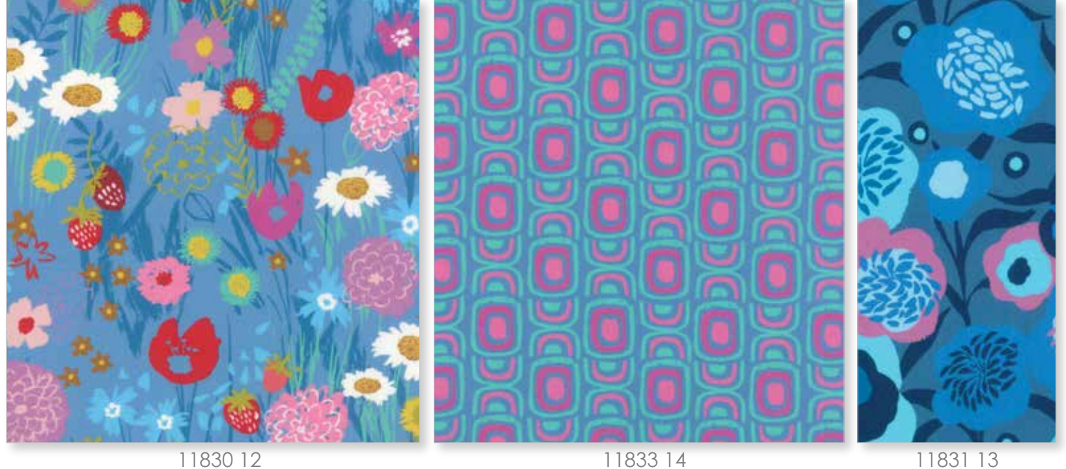
Growing Beautiful Crystal Manning February Delivery