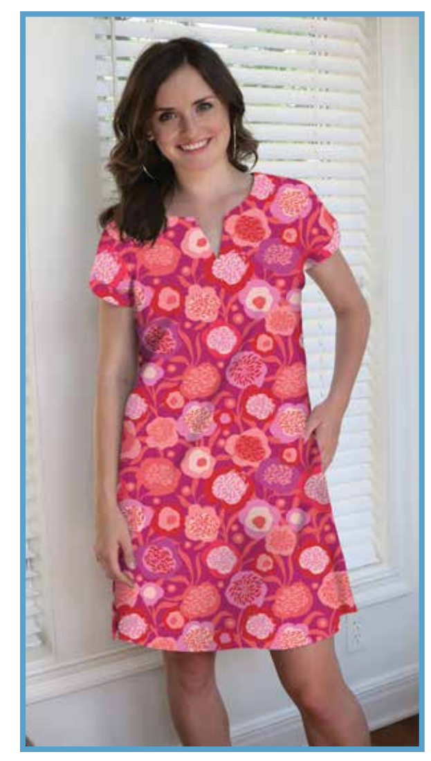
pattern by Indygo Junction Designs IJ 1151E / IJ 1151EG Shift Dress