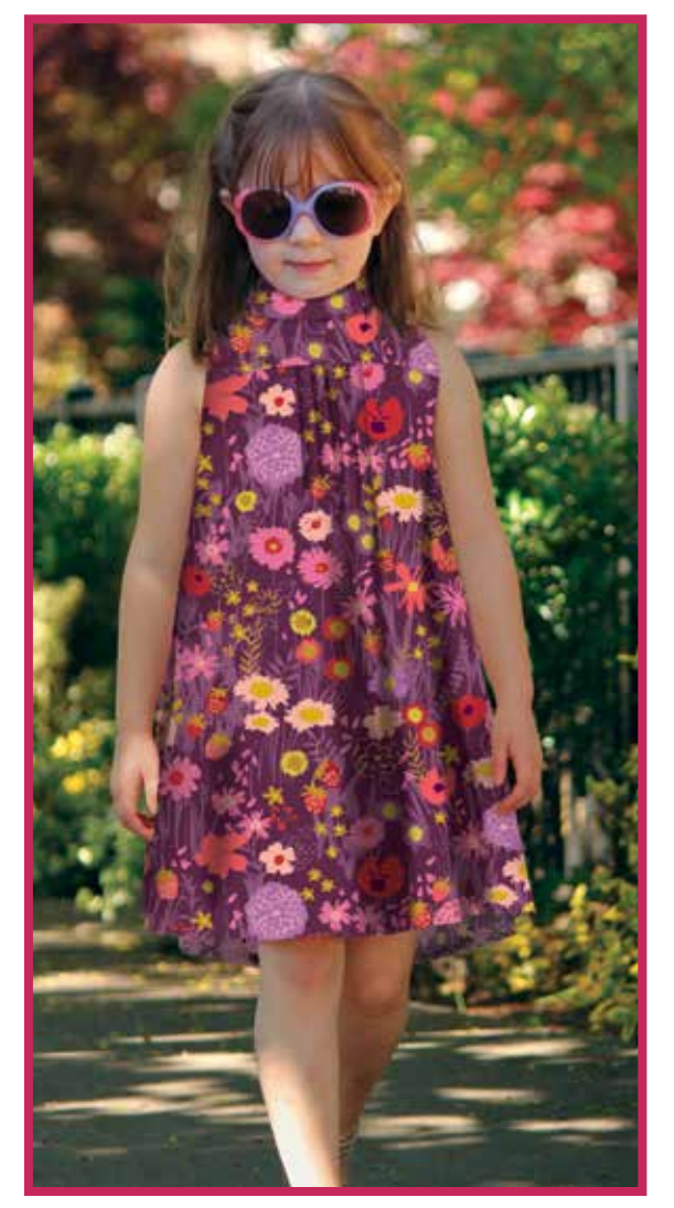
pattern by Olive Ann Designs OAD 97 / OAD 97G Rose

Painterly flowers are complemented with abstract patterns in Growing Beautiful, a vibrant new collection suited for garments and quilts. There is a peony print – one of my springtime favorites – and a field of wildflowers, all painted in a bold palette of reds, berries, eggplant, teal and a pop of chartreuse. There are four Growing Beautiful prints on Rayon, it's lovely drape is perfect for dresses, shirts and skirts.