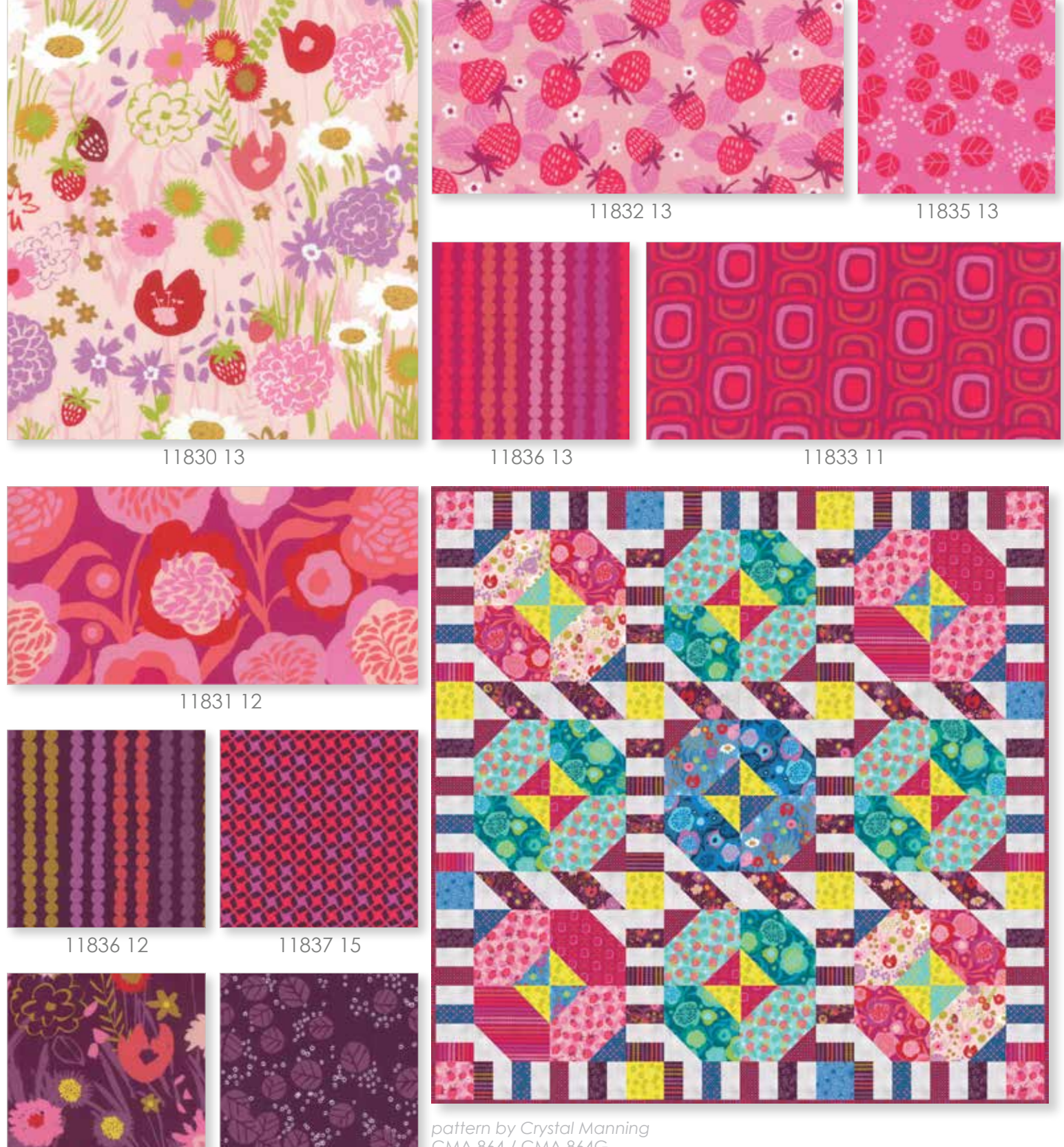
pattern by Crystal Manning CMA 864 / CMA 864G Penny Lane Size: 64'' x 64''