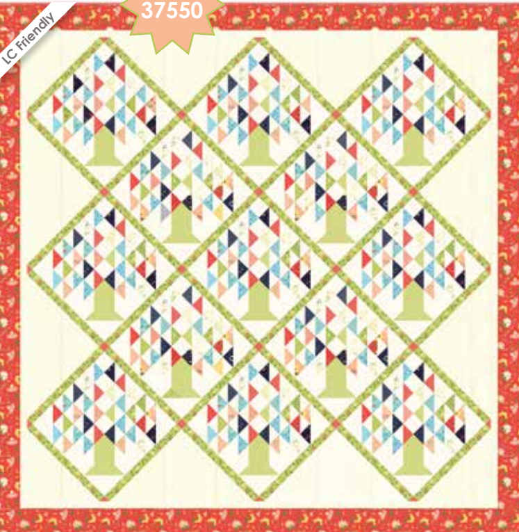
KIT37550 QLD 166 / QLD 166G Family Tree Size: 77" x 77

Pattern QLD 166 Family Tree (shown here) by A Quilting Life Design. Also available as KIT37550.