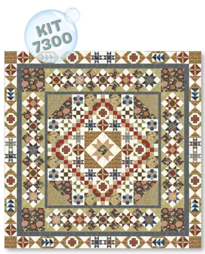
KIT7300 William Morris Medallion Size: 72" x 72" PSJ7300 William Morris Medallion Pattern/Journal