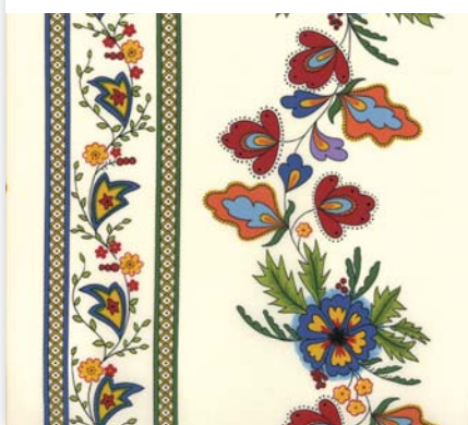
Reduced to 25% to show pattern.