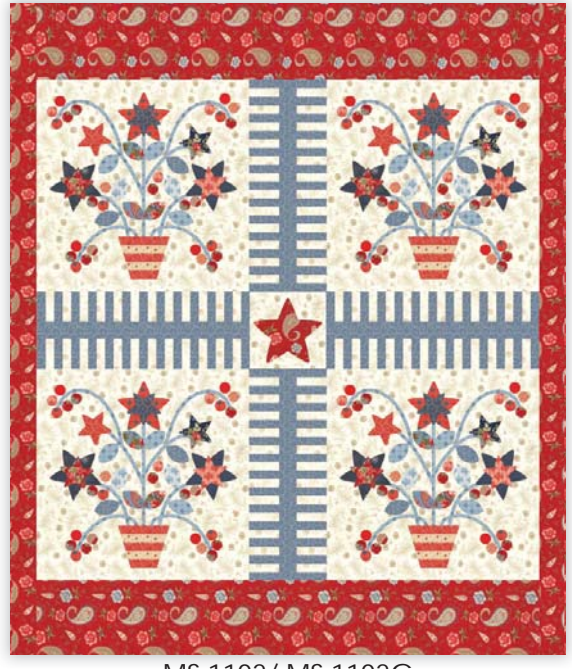
MS 1102/ MS 1102G Lizzies Big Flowers Quilt measures 65" x 79"