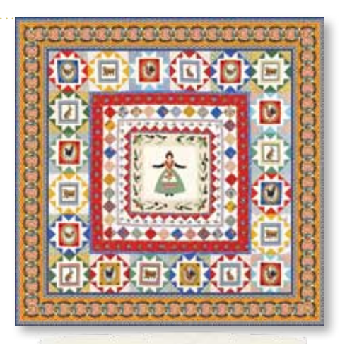
AJ 269/ AJ 269G French Country Quilt